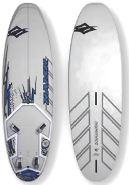
Kailua Jr. 120