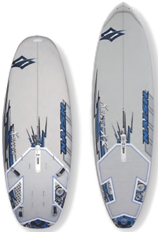
Kailua 180, 230 & XR